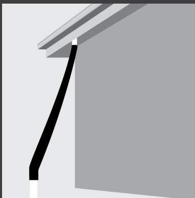
Redirecting water from incomplete pipes and guttering